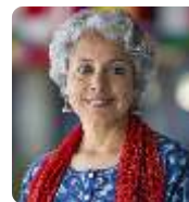
Dr. Soumya Swaminathan Chairperson, MS Swaminathan Research Foundation